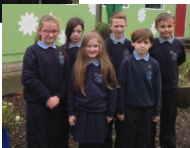
New Row PS Eco Council