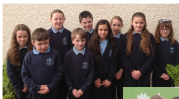
New Row PS School Council